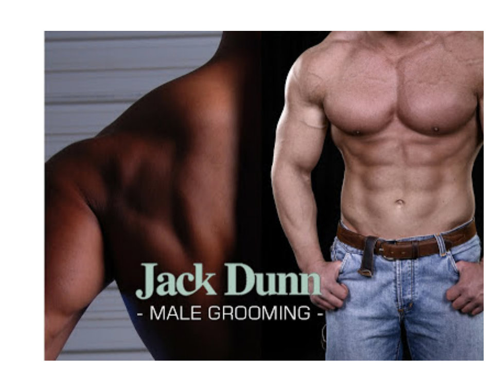
Male Grooming Crack To Sack Wax